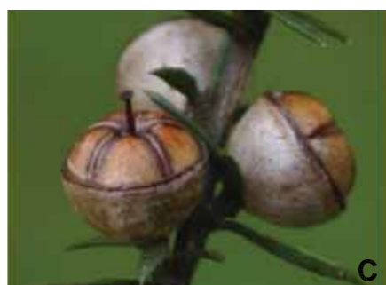
Fig. 1 Leptospermum scoparium (manuka). A , plant growing as a tall shrub in regenerating bush. Photo: Roy Edwards. B , white flower typical of most wild forms. Photo: Trevor James. C , capsules that contain numerous seeds. Photo: Trevor James.

It is a native shrub or small tree of variable height (ranging from a prostrate growth form up to a 4–8 m tall tree) and varies greatly in size