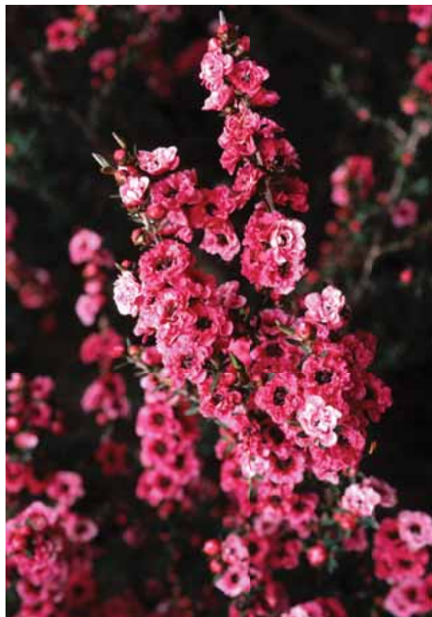
Fig. 3 Leptospermum scoparium 'Red Damask', a popular double-flowered garden cultivar.

have taken a strong like to its leaf decoctions as well (Stephens et al., 2005). The common name 'tea tree' was apparently given by Captain Cook, as a tea substitute was made from manuka leaves by Cook's men and the early settlers (Salmon, 1980). European settlers also used manuka as firewood, for fencing and in the manufacture of tool handles (Salmon, 1980).