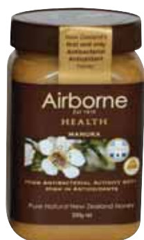
Fig. 4 Manuka honey being promoted for its medicinal properties.

It was shown to have antibacterial effect against Helicobacter pylori (Somal et al., 1994), Escherichia coli (Mavric et al., 2008), Staphylococcus aureus (Allen et al., 1991; Mavric et al., 2008), methicillin-resistant S. aureus , and a number of vancomycin-resistant and -sensitive Enterococcus strains (Cooper et al., 2002).