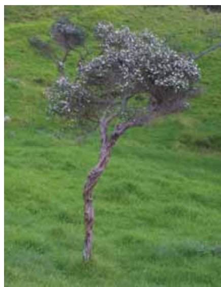
Fig. 2 Leptospermum scoparium growing as a 'weed' in pastureland.

Although it is a native plant, manuka was perceived as a noxious weed of farmland for a large part of the 1900s, and indeed, it is still listed in the current edition of Common Weeds of New Zealand (Fig. 2; Roy et al., 2004). Its eradication was a widespread goal because the species was seen as a major impediment for development of the hill country (Bates, 1940; Hamblyn, 1948; Madden, 1951; Roberts, 1957; Small, 1961; Marshall, 1962). Bates (1940) for instance, complained that the control of manuka "is often very difficult and uneconomic because of high maintenance costs per acre in the incessant struggle against this persistent weed". Supporting such views, publications like Sheepfarming Annual and the New Zealand Journal of Agriculture published numerous articles providing advice for farmers on how to clear manuka from hill country.